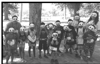
The Puffy Pandas at Summer Day Camp