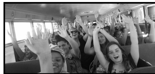
Happy Day-Campers on the bus!