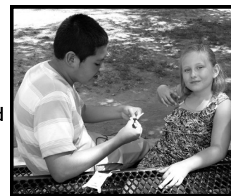
Making god's eyes with yarn and popsicle sticks.

The last day of Summer Day Camp was July 31, and it was a growth-producing, fun-filled summer for 80+ kids! They enjoyed swimming, arts, crafts, sports, & cookouts, while also learning how to make friends and keep them, how to solve problems peacefully, and how to work together as a group.