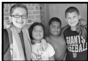
Summer Day Camp friends since they were little!