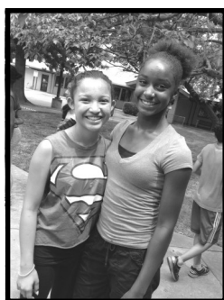
Lasting friendships are made at the Teen Center.

Summer is going by fast! We have enjoyed many activities such as dodge ball, card games, Connect-4, relay races, and water games to keep us cool. Let's not forget our movie nights filled with popcorn and yummy treats. We've also enjoyed being pool side at McKinley Park for picnics and swimming.