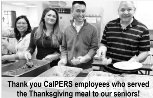
Thank you CalPERS employees who served the Thanksgiving meal to our seniors!