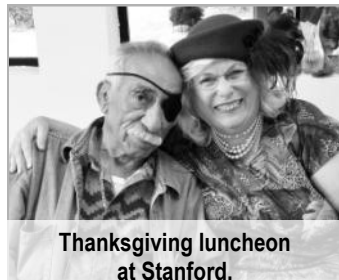
Thanksgiving luncheon at Stanford.