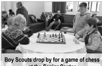
Boy Scouts drop by for a game of chess at the Senior Center