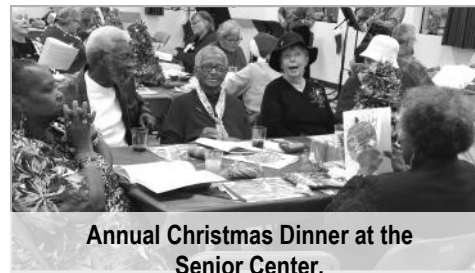
Annual Christmas Dinner at the Senior Center.