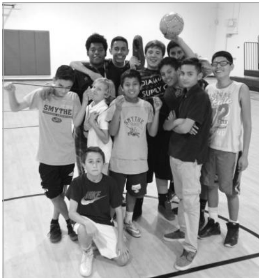
Stop by the Teen Center for a game of hoops.

We are always welcoming any new faces that come to the Teen Center! Come join us for fun times in February and March. We look forward to having our annual Valentine's Day party filled with delicious treats and good times with friends. March brings us the luck of the Irish and our St. Patrick's Day Party - make sure to wear something green!