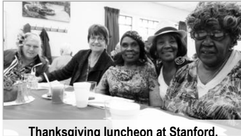
Thanksgiving luncheon at Stanford.