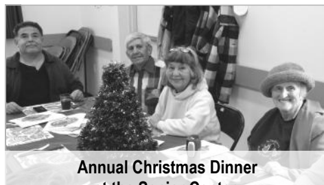
Annual Christmas Dinner at the Senior Center.