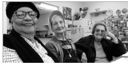
Thanksgiving luncheon at Stanford.