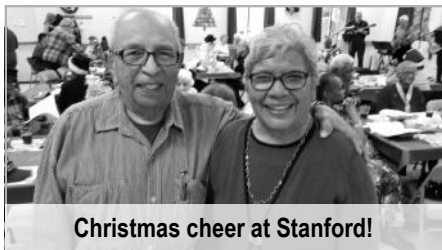
Christmas cheer at Stanford!