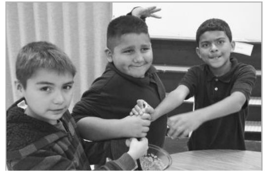
Working together to create the Thanksgiving feast.

The 3 rd session of the After School Groups will begin mid-March. We look forward to meeting and signing up more kids! For more information or to register a child for the next session, call Meg at 927-1303.