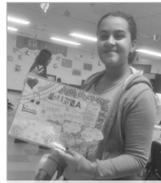
Making placemats for the Teen Center Thanksgiving Feast.