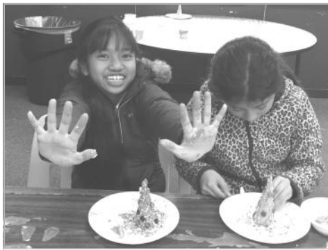
Making Christmas trees

After School Groups are designed to help children build important social skills, learn problem-solving skills, and establish meaningful relationships with peers through fun activities, including arts and crafts, sports, games, cooking, field trips, and more. The groups meet 4 days each week: 3:00-5:00 p.m. on Tuesdays, Thursdays, and Fridays, and 1:00-3:30 p.m. on Wednesdays.