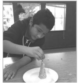
Decorating Christmas trees.

Happy New Year! We began the 2 nd session of our After School Groups on January 5 th ! We were super excited to have the kids back in our program. During this session, we will enjoy our regular fun activities and also special activities prepared for Groundhog Day, Valentine's Day, President's Day, and St. Patrick's Day!