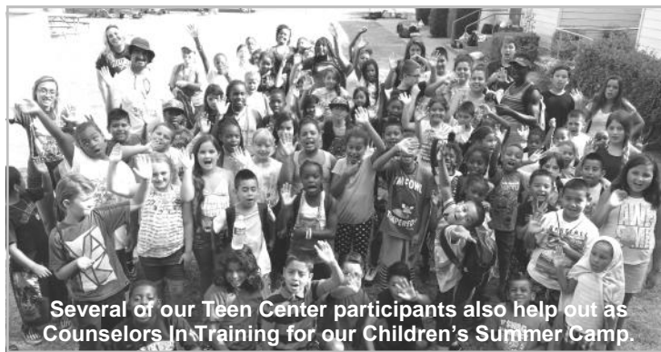
Several of our Teen Center participants also help out as Counselors In Training for our Children's Summer Camp.

Halloween is on the way in the Teen Center! We've planned ghostly music trivia, Pictionary, caramel apples and much more. With the leaves turning yellow and orange, what better way to enjoy the cooler weather than to have a scavenger hunt? We also have many things to be thankful for this year in Teen Center. We are looking forward to making our Thanksgiving feast, complete with all the trimmings, a great success!