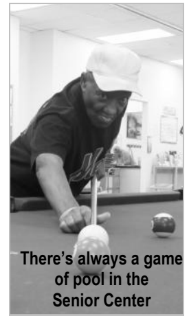
There's always a game of pool in the Senior Center