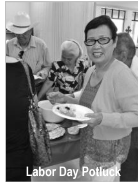
Labor Day Potluck