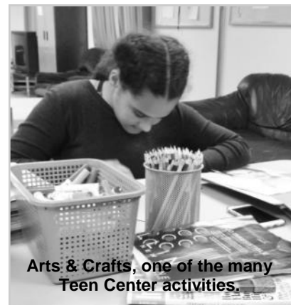
Arts & Crafts, one of the many Teen Center activities.

You can enjoy treats from our snack bar and join us in our daily snack. It's a great opportunity to come and hang out with friends and meet lots of new ones. For questions or more information, please call Erika at (916) 927-1303.