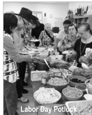
Labor Day Potluck