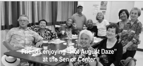
Friends enjoying "Hot August Daze" at the Senior Center