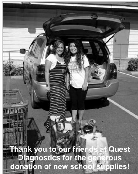
Thank you to our friends at Quest Diagnostics for the generous donation of new school supplies!